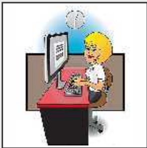
Newspaper Distribution Systems

From the Newspaper Distribution System the Order data is downloaded to the Bundle Production Control, PRO 4000.