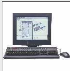
Bundle Production Control PRO 4000